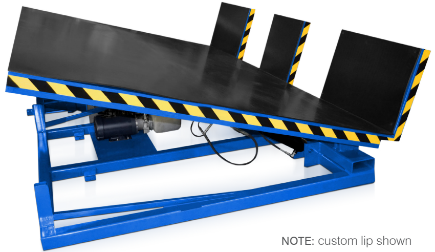
NOTE: custom lip shown