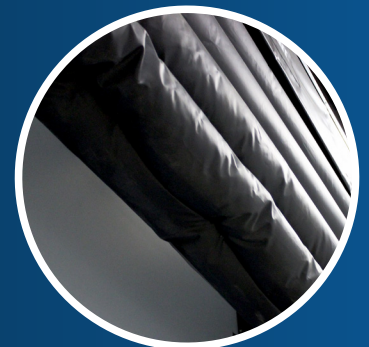
Optional: Additional drop on head air bag