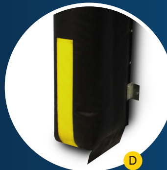
24" (610 mm) guide stripes