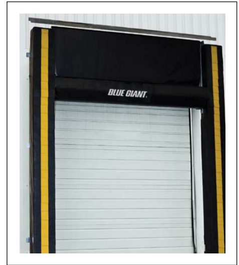
BGDSA Adjustable Head Pad Dock Seal